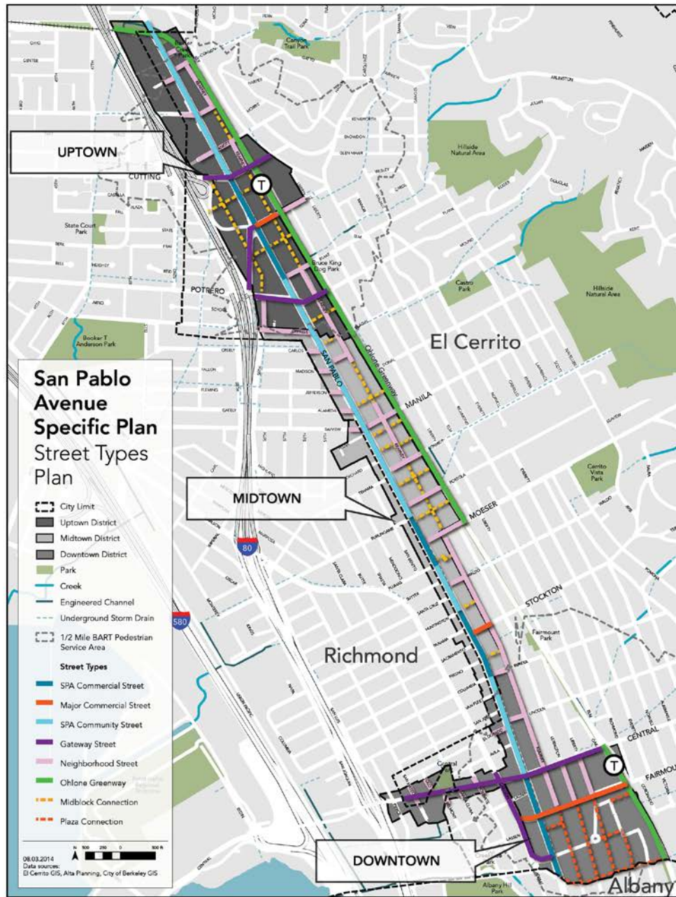
Figure 2 Specific Plan