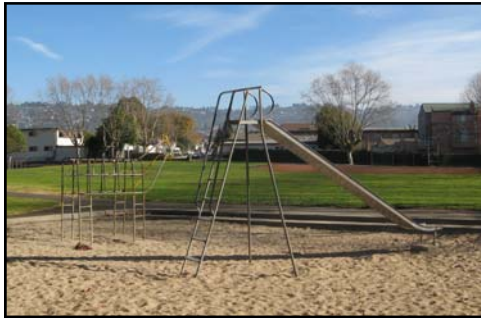
Central Park 5701 Central Ave

El Cerrito City Hall – 10890 San Pablo Ave, El Cerrito